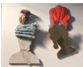
Some of the projects of the "Lavoisier challenge" exhibited last May at the "Palais de la découverte", museum of science in Paris.